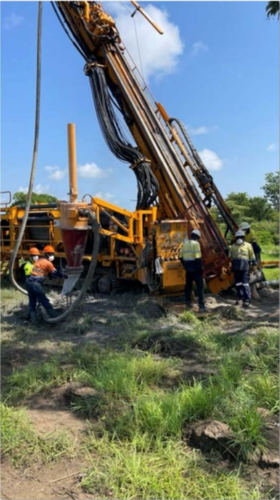
Photos 1 & 2: First RC drill hole underway at Kambale Graphite Project

It is also intended, subject to drilling results, to calculate a JORC 2012 “Exploration Target” and with that a road map for a review and update of current Inferred Resources of 14.4Mt at 7.2%C (graphitic carbon) for 1.03Mt contained graphite (JORC 2004)(refer Table 1).